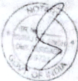
Photo Copy Attested